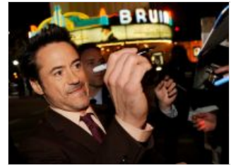
'Exton?' It's just not that weird