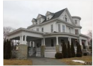
House of the Week: Victorian in Lansingburgh