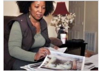
Blame battle doesn't fix mold problem