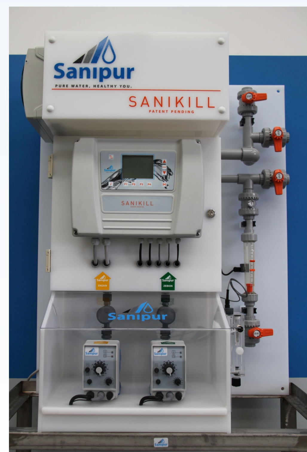
Figure 1. The monochloramine generation system