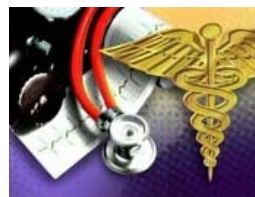
1 of 1 Click to enlarge

Legionnaires' disease can be very serious and can cause death in up to 30 percent of cases. Persons most at risk include those over 65, smokers and those with chronic lung disease. Most cases can be treated successfully with antibiotics.